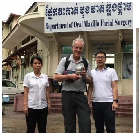
A grateful parent