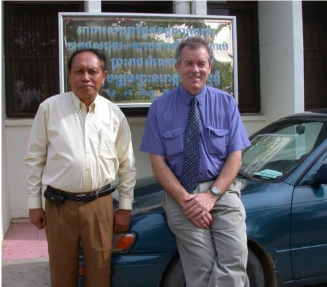
First trip to Cambodia