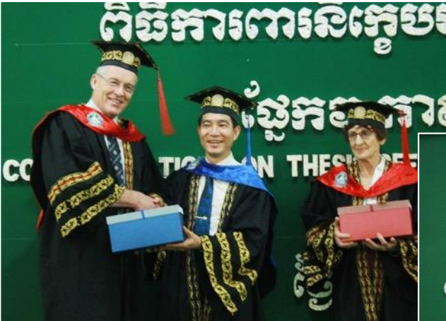
Graduation ceremonies in Cambodia