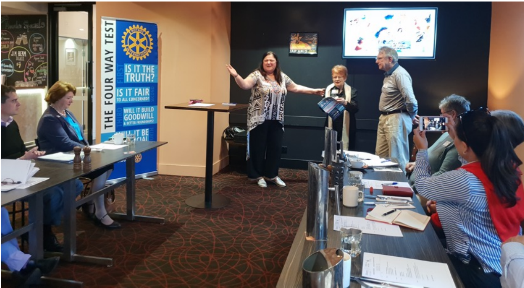
New Farm Club inducting a new member