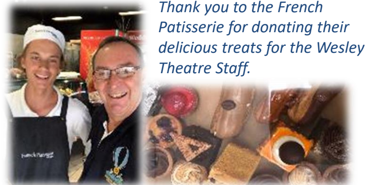
Thank you to the French Patisserie for donating their delicious treats for the Wesley Theatre Staff.