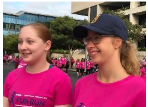
Congratulations to the Rotary High-Rise Team raising funds for Rotary Projects by completing the International Women's Day Mater Fun Run. At last count they were a little short of their target so please DONATE NOW to get them over the line. Go to the website www.womensfunrun.com.au Mater Womens Fun Run and click Donate. Under the team enter Rotary Club of Brisbane High-Rise to make your donation.