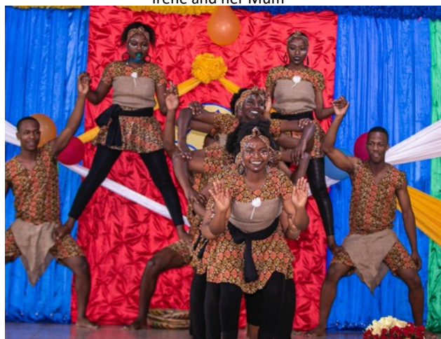
Entertainment (above) and the Graduates from the Girls' School