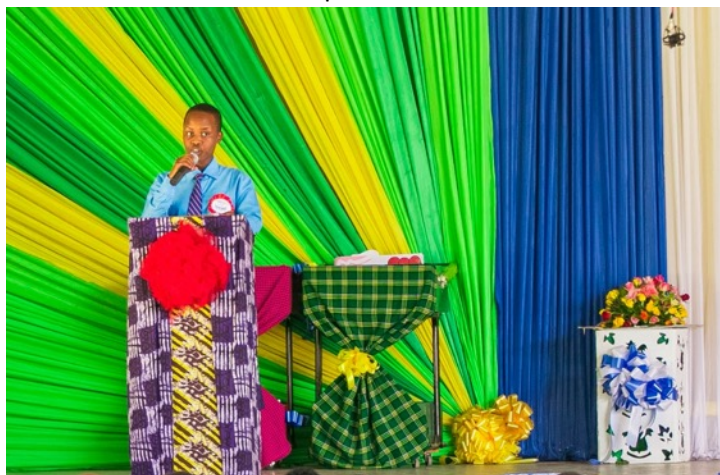
Speeches at the Graduation ceremony