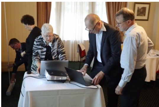
Trying to get the technology to work