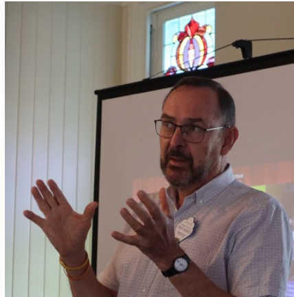
That beard is going!