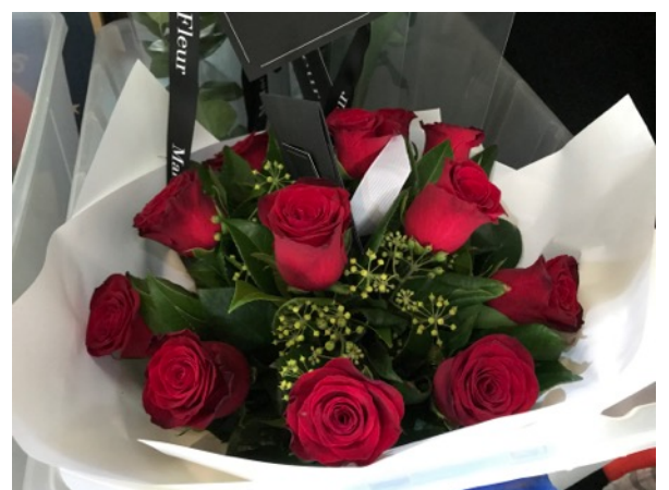
Red roses were the most popular