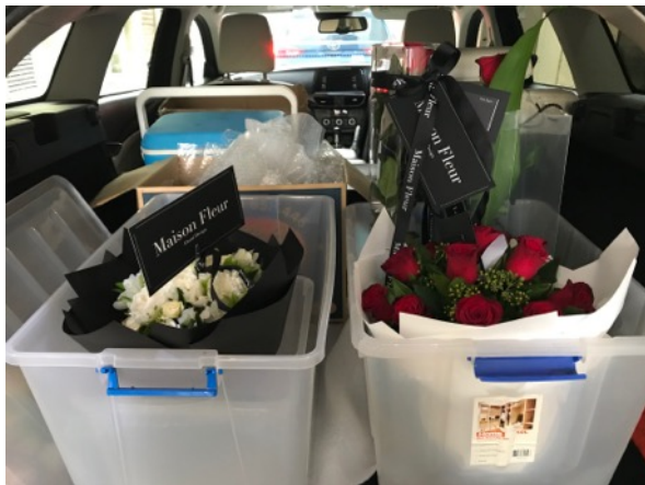
Cars packed ready to go