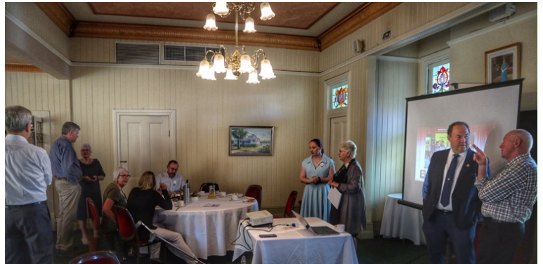
Arviers survive quarantine and reunited