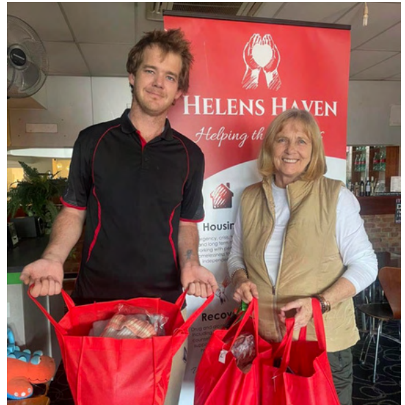
July 7 - Goodna Street Life, Charity Helping the Homeless with housing, health and living

Goodna Street Life is an independent charity providing housing and support for the homeless and vulnerable people in our community. Established in 2015 by a group of dedicated locals hoping to make a difference in our community, the group sought to establish a local shelter for the homeless, and people forced onto the streets.