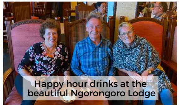
Happy hour drinks at the beautiful Ngorongoro Lodge