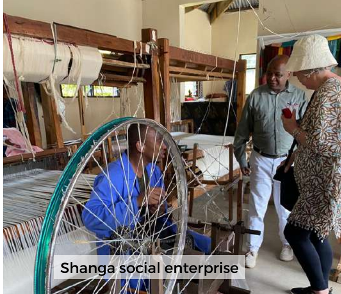
Shanga social enterprise