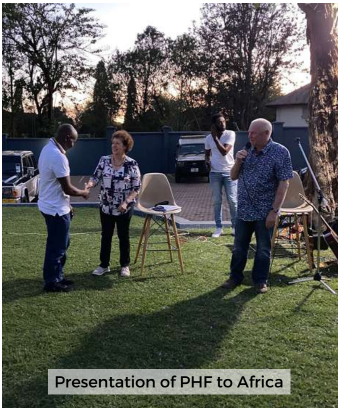
Presentation of PHF to Africa