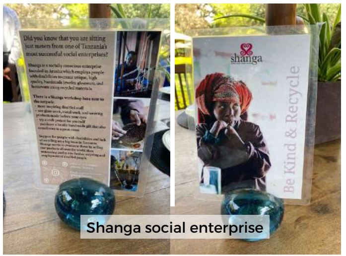
Shanga social enterprise