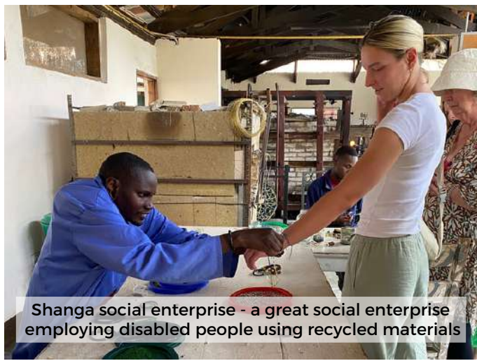
Shanga social enterprise - a great social enterprise employing disabled people using recycled materials