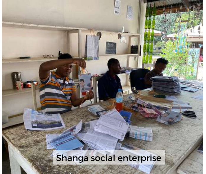
Shanga social enterprise