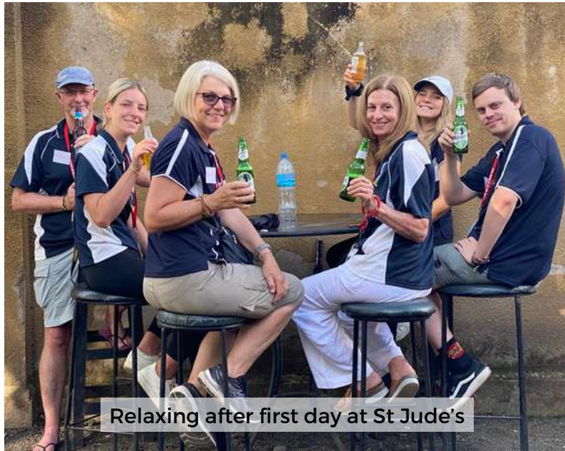
Relaxing after first day at St Jude's