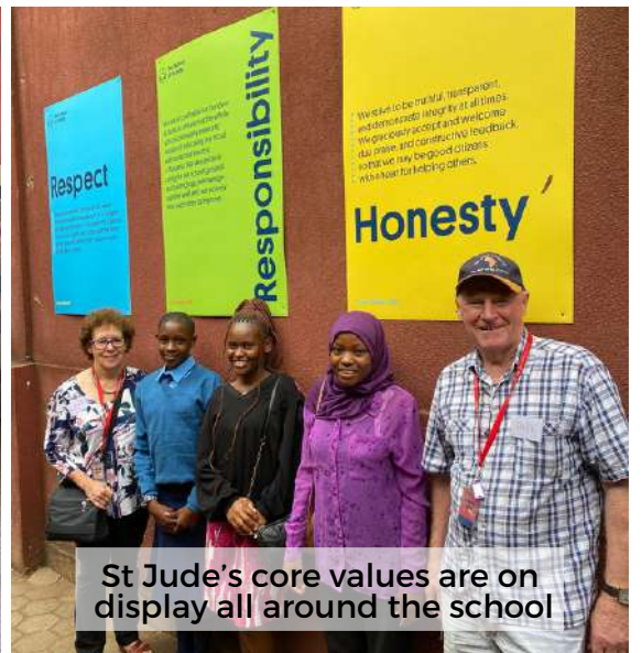
St Jude's core values are on display all around the school