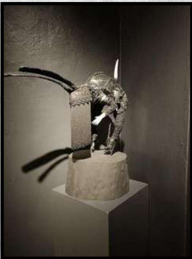
The Will Of The Heavy Tongue (Thread Thrown Voice)