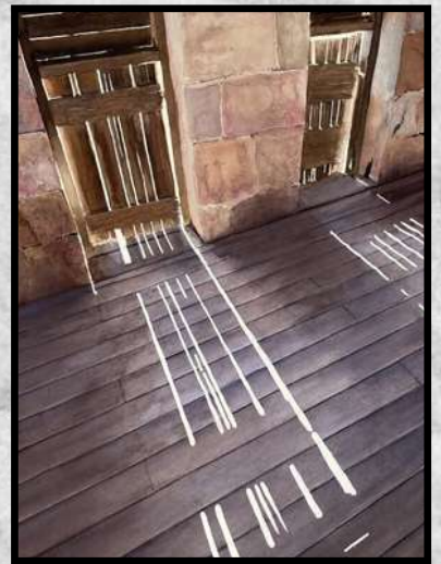
Boards can talk