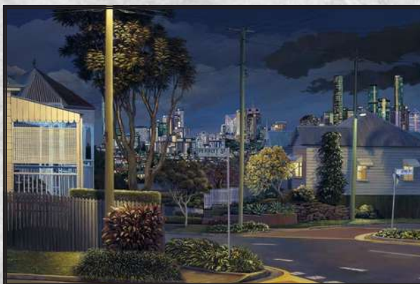
Turning for Home