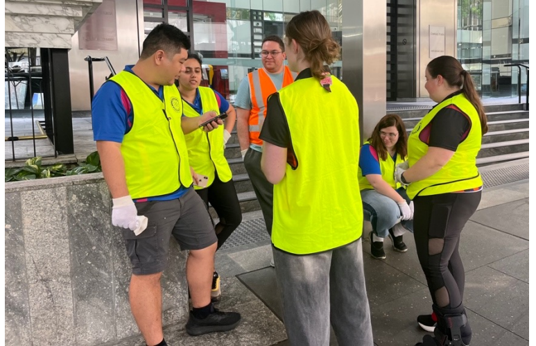
Some of the River City Rotoract team waiting for the next artist to arrive – we couldn't have done it without them!