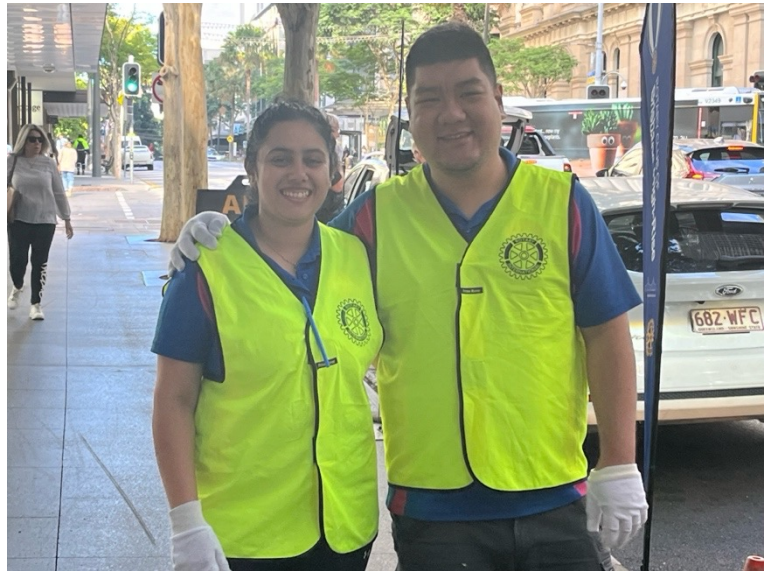
2 members of the River City Rotract Team