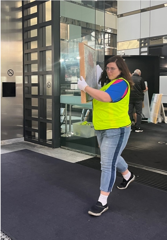
One of the Rotoractors bringing a work out