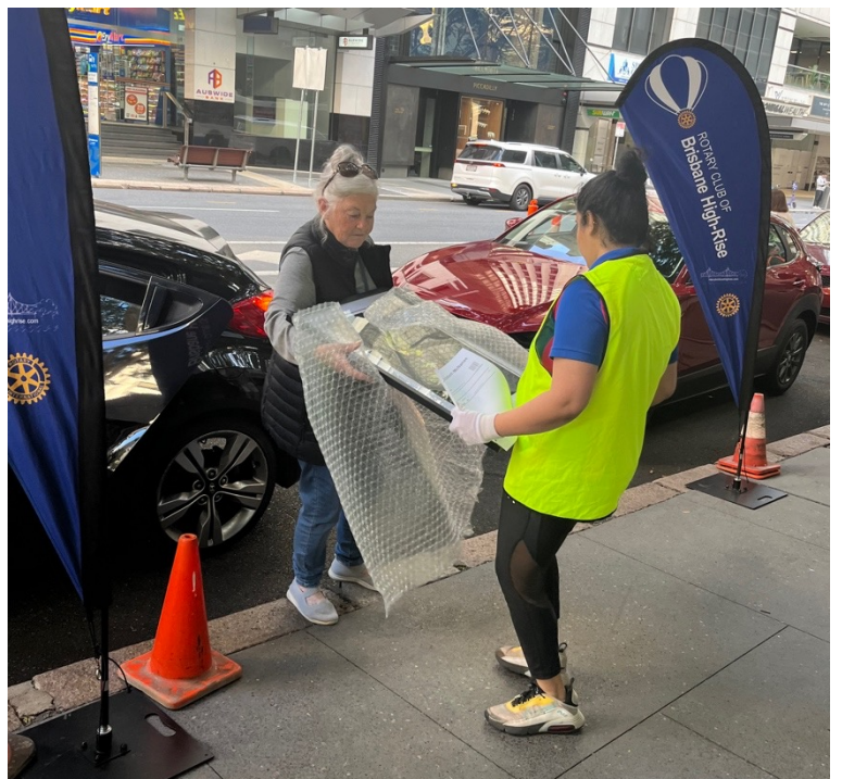
Handover to an Artist