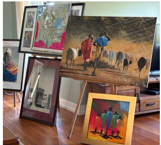
Phil Gough's African Artworks on display