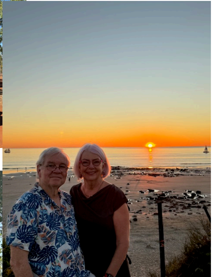
Cable Beach sunset