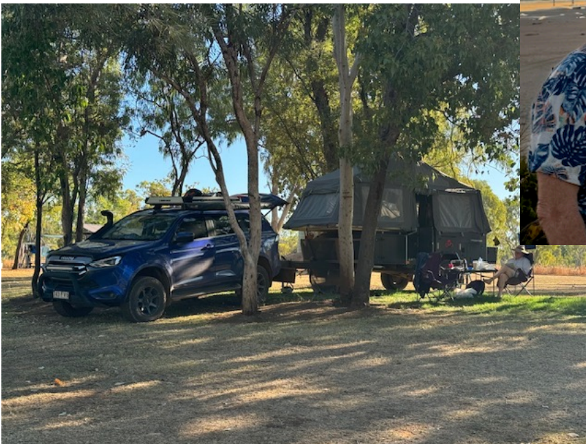
Living the life in the shade at their Mt Hart camp spot