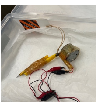
Prison secret tattoo machine