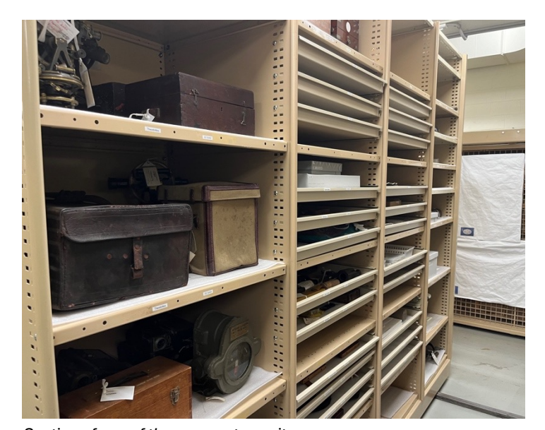
Section of one of the compactus units.