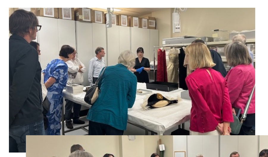
Clothing from the collections - on right is a