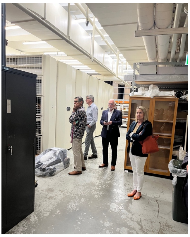
The scale of the environmentally controlled secure storage facility within the museum building.