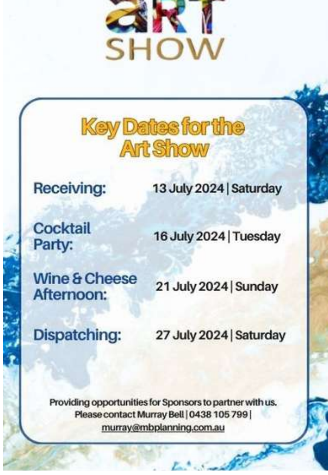
Rotary Art Show - Volunteers Needed