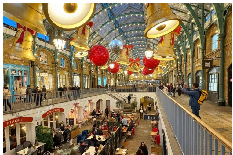
Inside Covent Garden