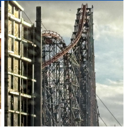
The roller coaster at Blackpool