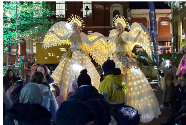
Street parade Leicester City