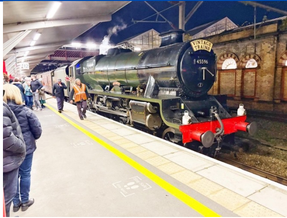
Steam Train in Blackpool – named Bahamas