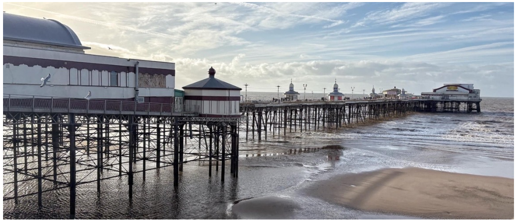
Blackpool North Pier