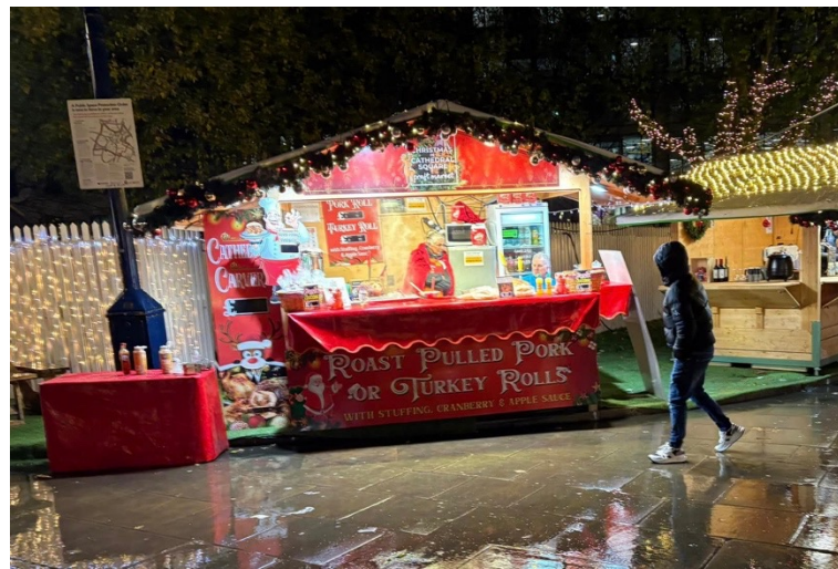
Food vendor Birmingham