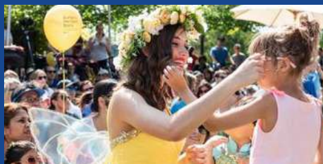
(details on page 3)