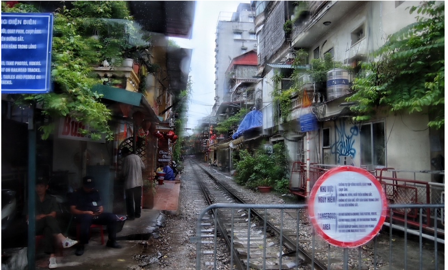
This is the famous Train Street in Hanoi that you see in film clips where market traders have to move their goods every time a train goes through. But no market today, and our bus could not stop for us to take a picture. I had to take the photo through the bus window as the bus slowly drove along an incredibly busy main road. In the rain.