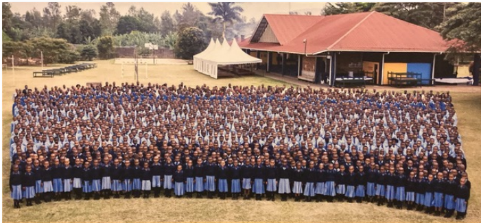
Thank you, Rotary Club of Brisbane High Rise, for supporting St Jude's for 15 years!