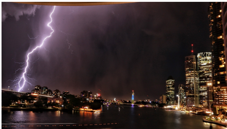
of the 24 Jan storm over Brisbane