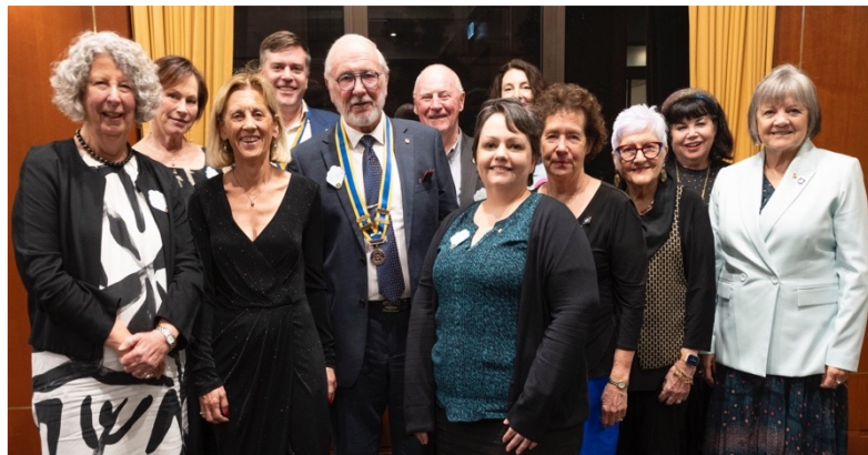
The 25-26 Board, plus a few extras, taken at Changeover June 26