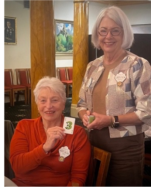
Virginia going to extreme lengths to get sympathy, but on the mend.