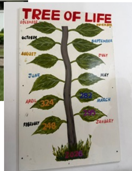
The Tree of Life with the number of births embroidered on the leaves

The hospital staff are very excited about the ambulance.