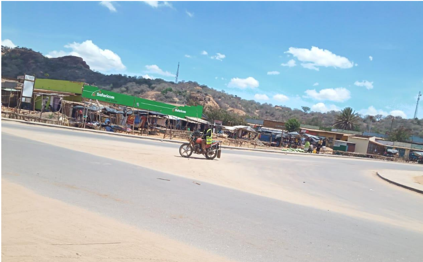
A photo of Mutomo in the tarmac with demolished buildings along the road before the rain season