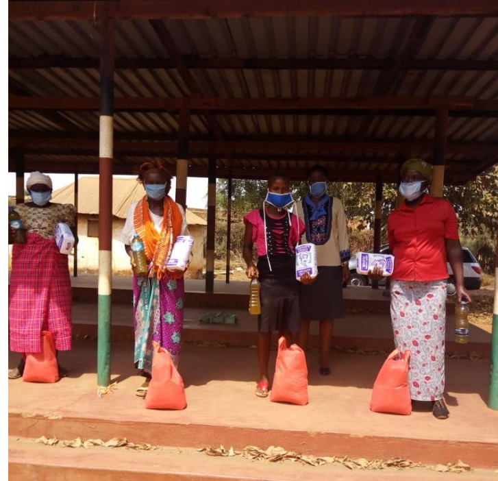
Families receiving food support during the pandemic from Better future and SMPI