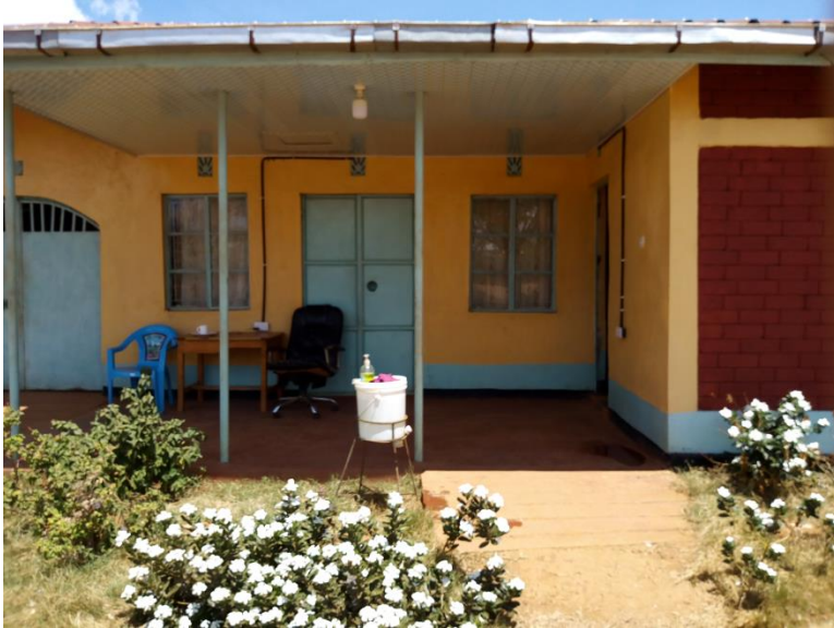
Hand washing facility outside SMPI office