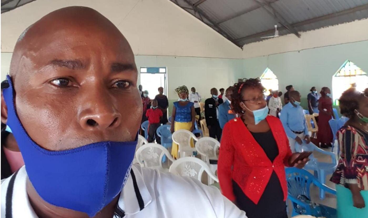
A church session in progress with people on masks and at one metre distance