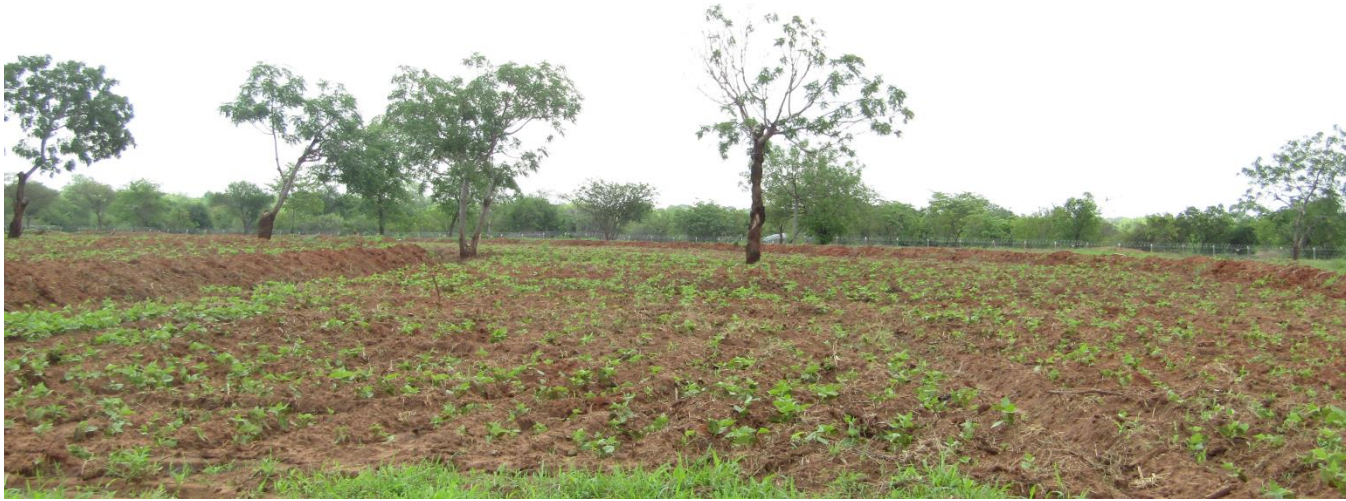
Beans at Stig agroforestry land