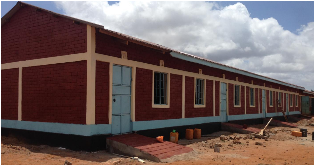
Construction of Kaunguni primary