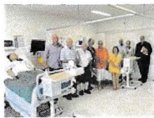
University of Wollongong