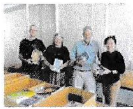
Book/Art Fair January $17,000