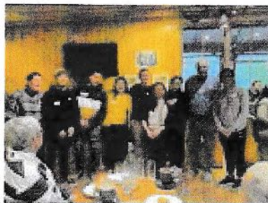
New employees at SCCAC supported by Bega Rotary