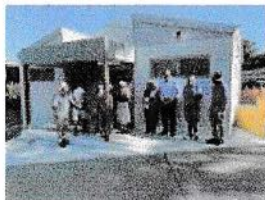
Bega Showground Amenities Block opened