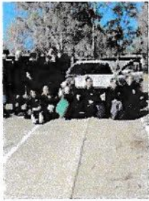
Rotary Youth Driver Awareness Program