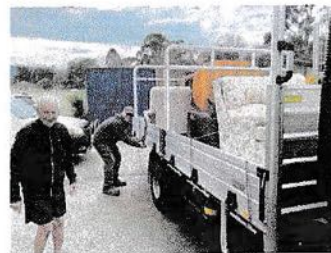
Collecting furniture for rental properties to house overseas employees at SCCAC