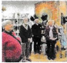
Publican's Wife's shop Bega