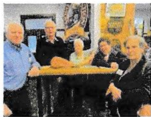
Merimbula and Pambula Rotary Clubs