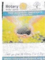
Adopt A Tree Certificates presented to all guest speakers supporting RI's environmental focus