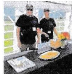
Support for Stand Tall youth event in Pambula in November

Ongoing residential and educational support for Sapphire Coast Community Aged Care employees