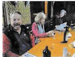
Bega Thai Restaurant