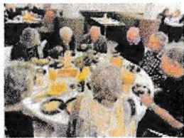
Kitty's Restaurant Merimbula