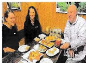
Breakfast Meetings held once a month