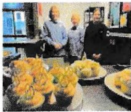
Fling Physical Theatre serving tea/coffee at five performances