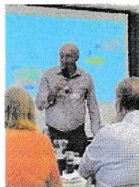
Combined dinner at Club Sapphire with Merimbula And Pambula Rotary Clubs