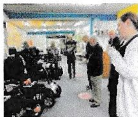
Visit Leef – formally - Mobility Matters