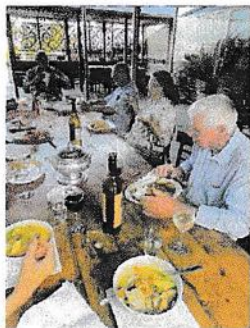
Thai Restaurant evening