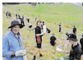
A lot a tree planting at Tandy Farm, Candelo