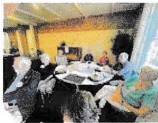
Narooma Rotary Club