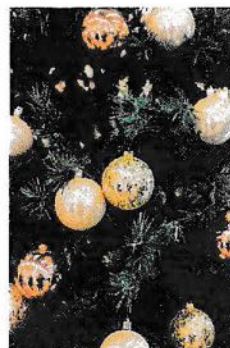
Christmas Party at Tathra