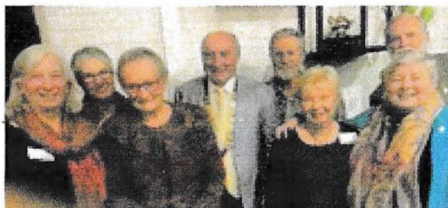
Bega Rotary Club Board for 2022/23