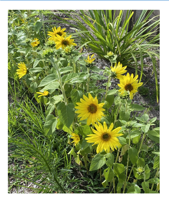
PDG Phil's sunflowers—from the "Seeds for Ukraine" packet?