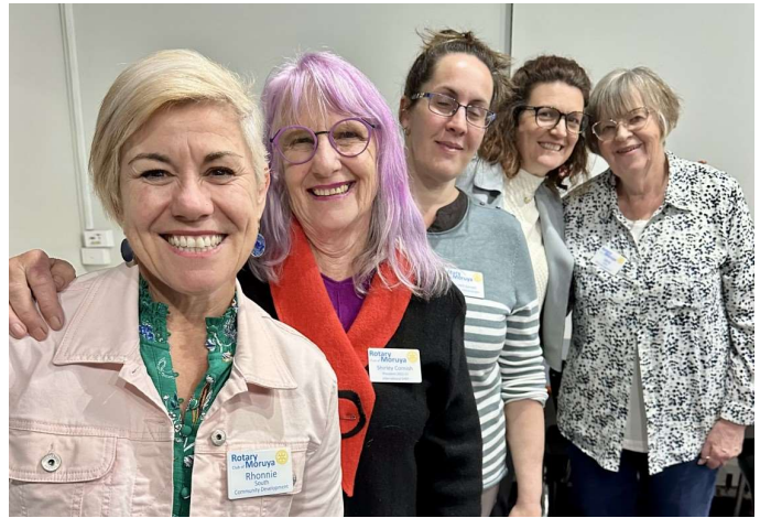
A Past President, a Secretary, a Director, a Races Manager and a supportive partner—a talented crew.