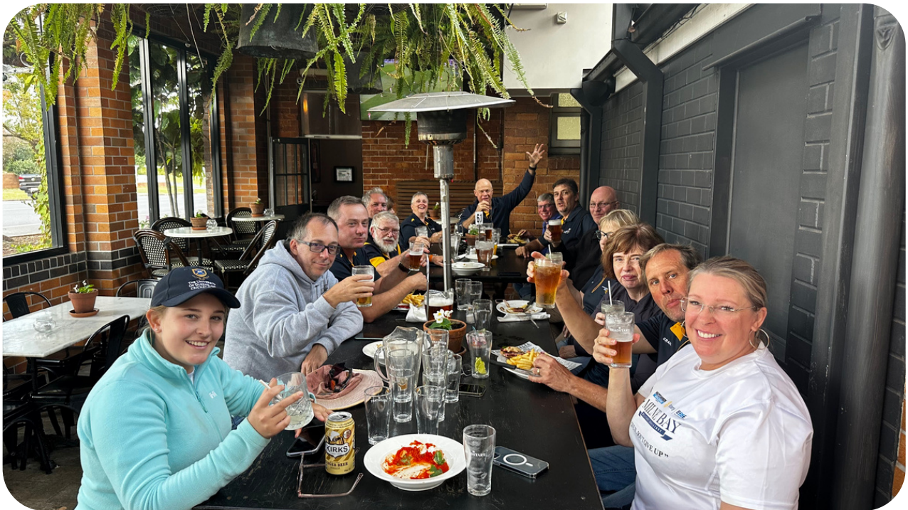
Toowoomba Metropolitan Rotary Club Members and families enjoying a well earned drink after a very successful Hutchinson Builders Run the Range 2023.

Congratulations to all members and keep up the enthusiasm for service and having fun.