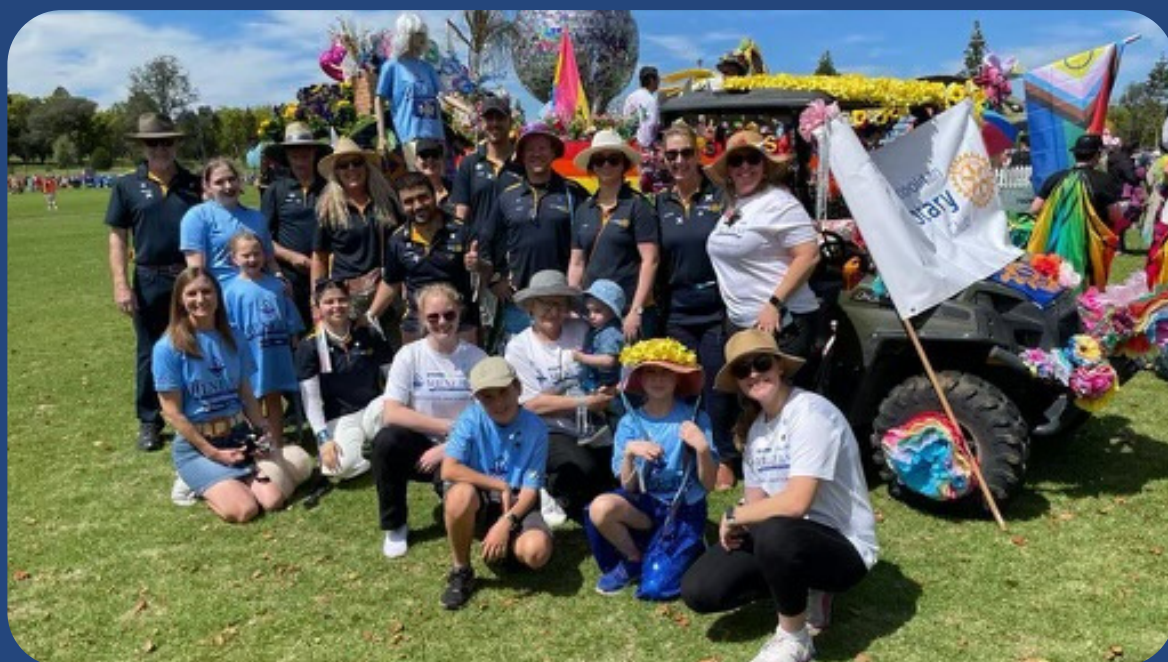
Toowoomba Metropolitan Rotary Club members and families after the Carnival of Flowers