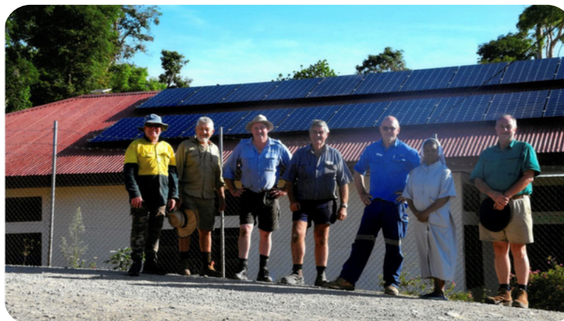
The East Timor Solar Project Crew.