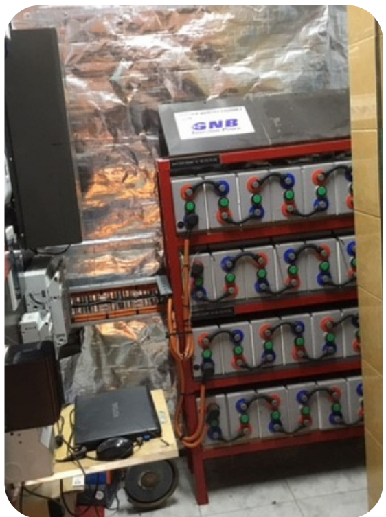
"Our" electrical switchboard and battery bank in East Timor.