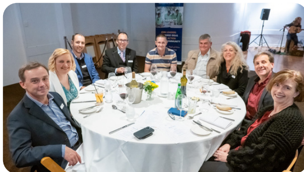
Spot the Ring Leader.