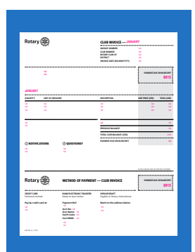
Sample club invoice

Rotary International bills clubs for dues and RI fees twice each year. You'll receive an invoice in early July and one in early January.