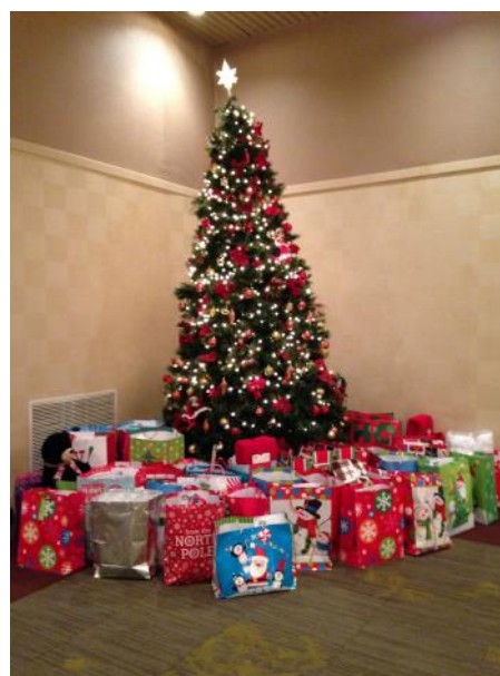
Gifts waiting at the Boys and Girls Home