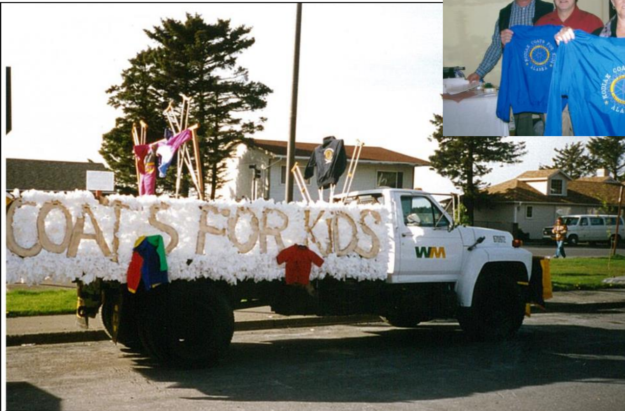
Photo at left: Coats for Kids float in the Memorial Day Week- end Kodiak Crab Festival Parade