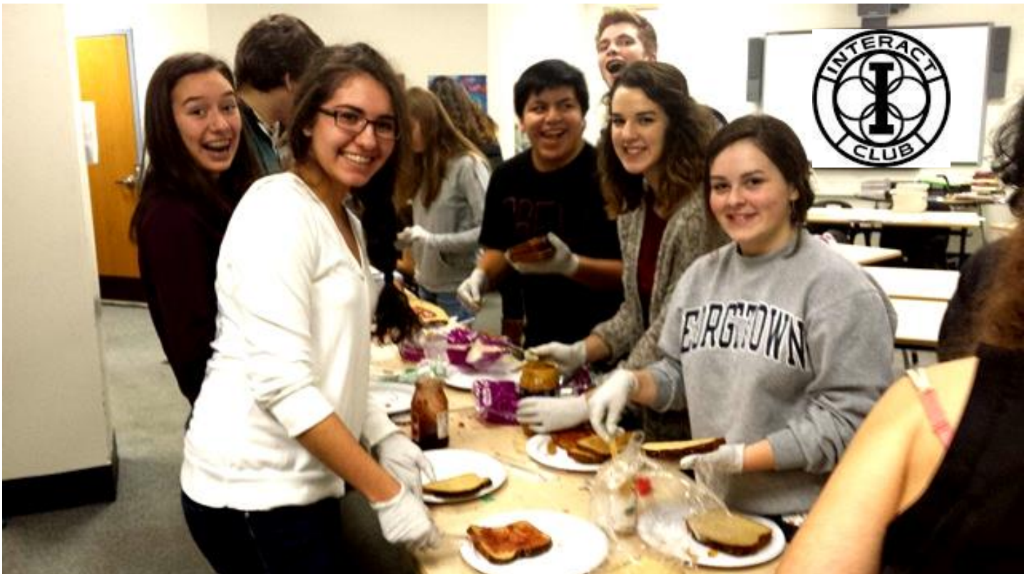
Anchorage Interactors make peanut butter sandwiches for the Brother Francis Shelter