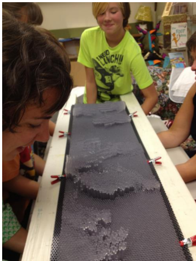
Ooooooooooooo! Look at what it does!