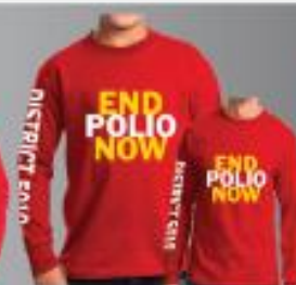
LONG SLEEVE T-SHIRT