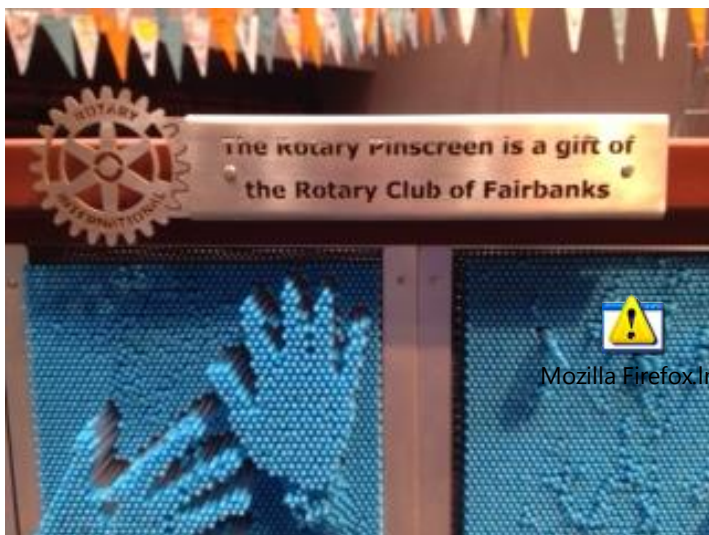
And, of course, a Rotary label

Want to see your club's activities in the District 5010 Bulletin? E-mail photos and news items to: impact@ak.net