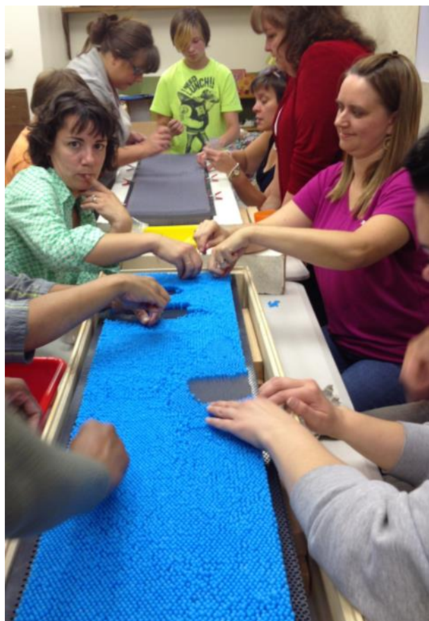
Many hands make light work?

Want to see your club's activities in the District 5010 Bulletin? E-mail photos and news items to: impact@ak.net