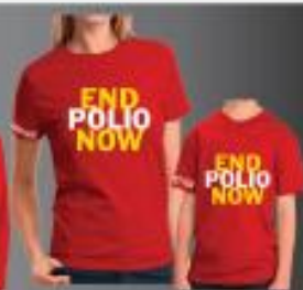
SHORT SLEEVE T-SHIRT