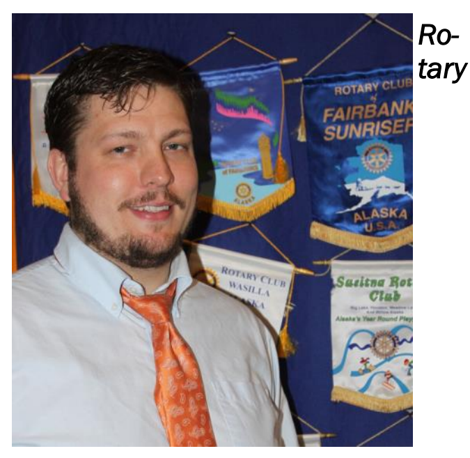
Youth Exchange alum from Ketchikan headed to Moscow to work in an embassy