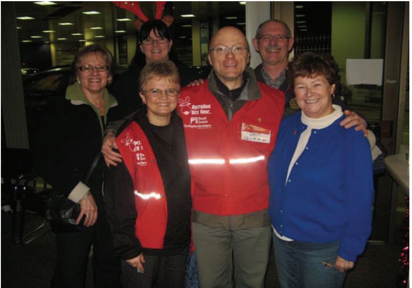
Photo of some of the Rotary Club of Lions Gate volunteers on New Years Eve

The 4 North Shore Rotary Clubs co-operated to deliver Operation Red Nose on the North Shore during December including New Years Eve. This year there were 269 volunteers, 290 cars were delivered safely home for a total of 6,570 km. and over $17,000 was raised for youth related projects.