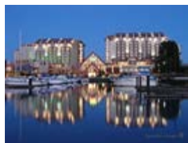
River Rock Resort