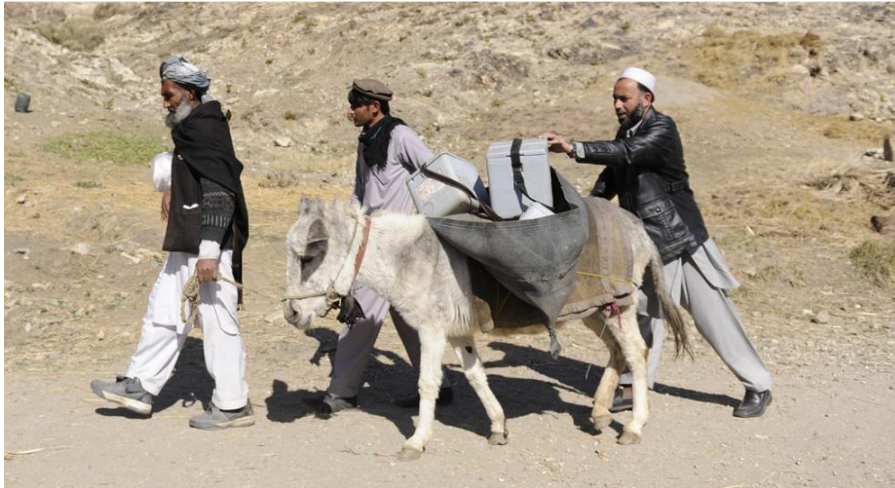
Members of a polio vaccination team transport vaccines in Afghanistan's Kunar Province

to all Rotarians in Rotary District 5040