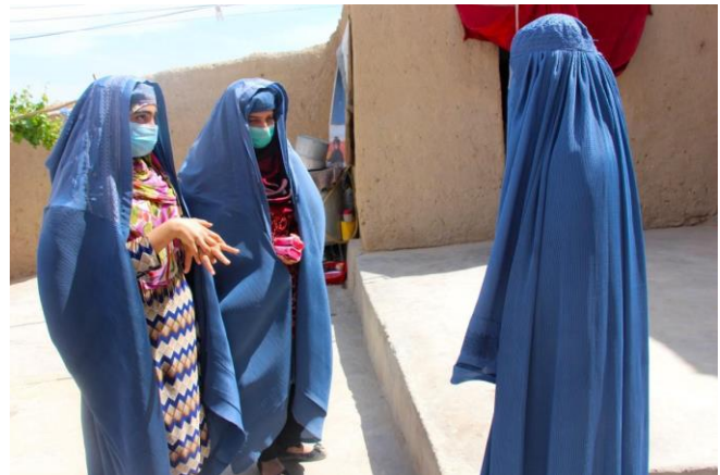
Local Health workers demonstrate the best way to wash hands.