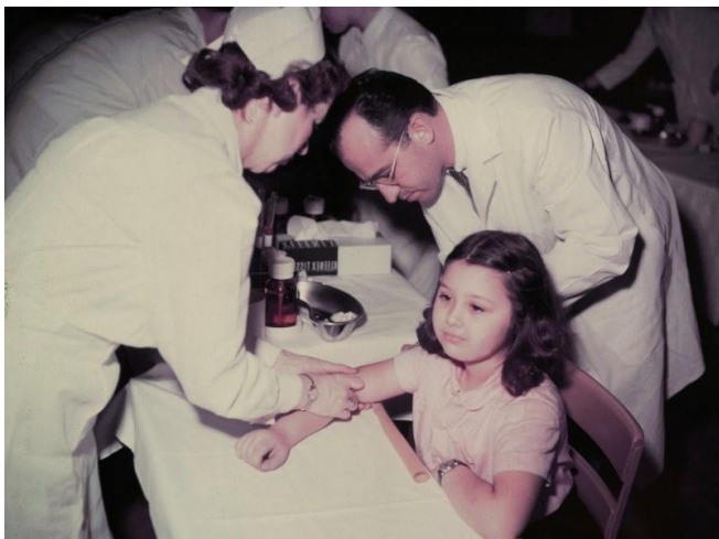
Dr Jonas Salk administers the polio vaccine to a child in 1955.

These are frightening times as the coronavirus spreads in ways reminiscent of the polio virus. It's instructive to remember what it took to nearly eradicate polio and a reminder of what we can do when faced with a common enemy.