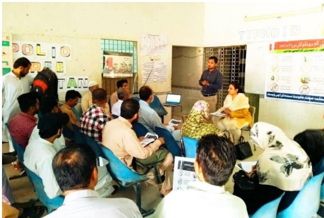
Polio staff conduct COVID-19 awareness training in Pakistan

► DONATE NOW at www.endpolio.org/donate .