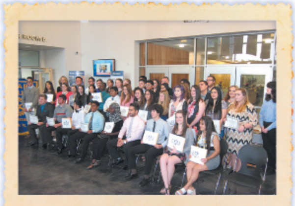
Scholarship winners, 2016.