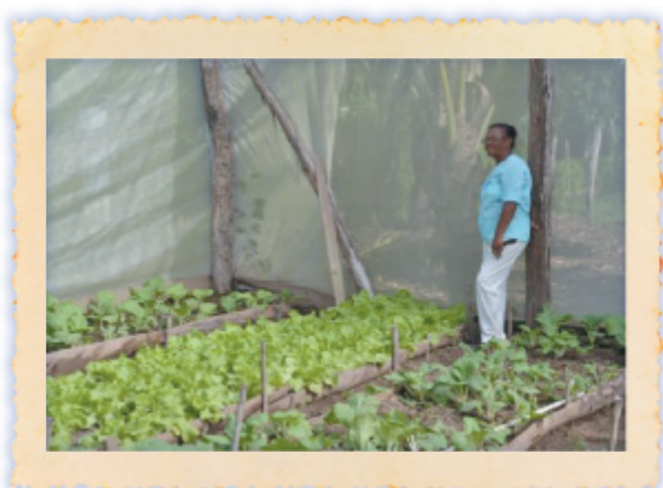
International Service project in Dajabon, Dominican Republic.

• By June 30, 2016, the club has awarded more than $3,750,000 in scholarships since the program's inception and total assets in the Everett Rotary Youth Foundation are $3,662,498.