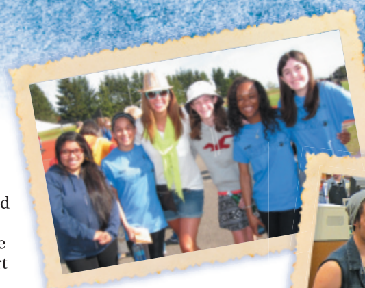
Providing student scholarships, tidying Rotary Park or helping at the VOA Food Bank, Rotarians serve.