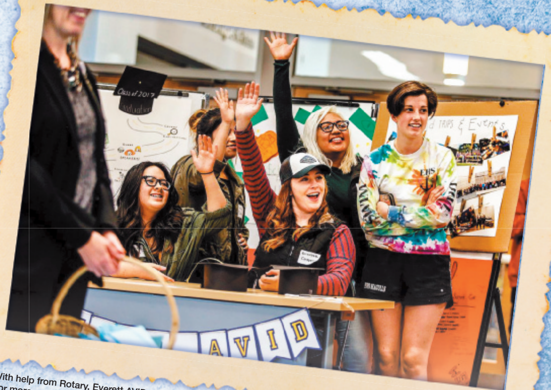
With help from Rotary, Everett AVID students prepare for their future. For more on our commitment to youth, see page 4.

In the century since, the Everett club has built a powerful record of service to Everett and the world. The club has expanded Rotary service by sponsoring “offspring” clubs in Marysville, Arlington, Snohomish and Edmonds, as well as the Port Gardner and South Everett Mukilteo clubs in Everett. These in turn have sponsored clubs in Lake Stevens, Stanwood, Monroe, Marysville and Duvall.