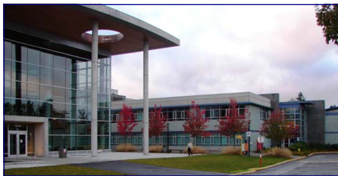
Kwantlen University College 12666 72 Avenue, Surrey, BC Registration is at the building on the right