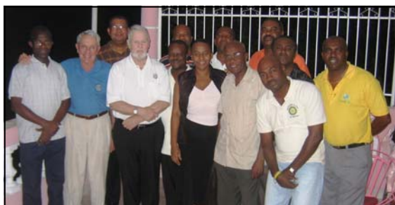
Photo at the meeting of the Rotary Club of Jeremie