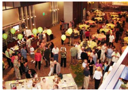
A room full of fellowship