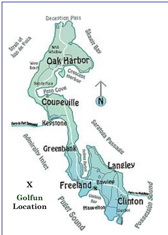
Whidbey Island, Washington Map from Wikipedia

The restaurant gets to showcase their food, ambiance & service, to four groups of 40 people. They donate the food and service, and get the money from the liquor sales. To purchase tickets (cash or cheque only), call Ginny Harrison, White Rock Travel, 604-531-2901. My email address is ginny@justpack.com