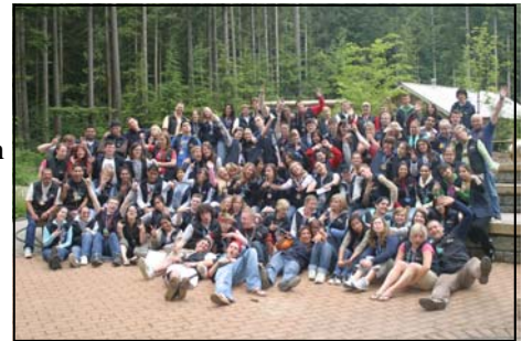
District 5050 RYLA

I spent my first 13 years in Rotary serving at various club positions - including as Club President in 1993/4. I became involved at the District level when I joined the RYLA Committee and attended my first RYLA in May 2000. Then I made the usual mistake - I went to two Committee meetings, missed my third one and found out at my next club meeting that I had been elected as RYLA 2001 Chair.