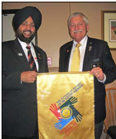
Presentation of the 2009-10 Rotary International theme banner