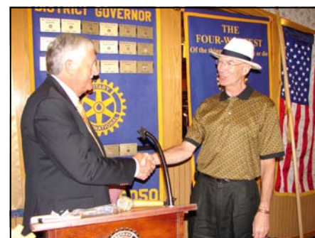
Transferring DG's Banner - Page 2