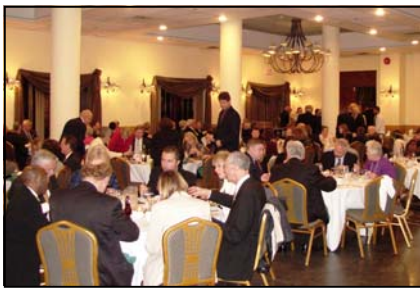
Rotarians enjoying fellowship