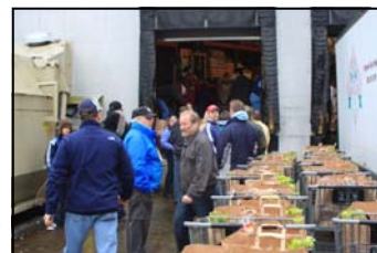
Everett Food Bank

Internationally, they both attended the 2001 Rotary International Convention in San Antonio, Texas, and traveled to Mexicali (in the Mexican state of Baja California Norte) for a project that