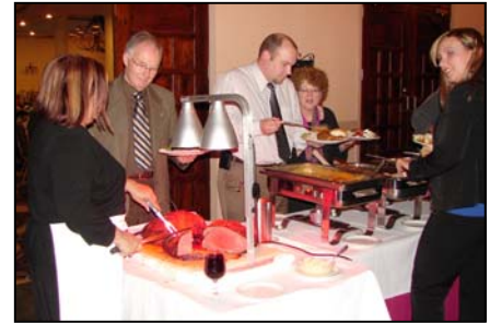
A fantastic carvers buffet