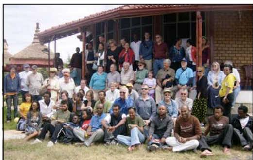
The whole group after lunch break on the bus ride back to Addis.

Again each team had extremely different experiences and have different impressions of what they experienced. I saw celebration of life, wonder about these “white skinned” visitors, a strong sense of community, family and survival. I better understood the challenges that the country faces – but I also experienced wonder, life and love.