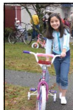
A very happy girl