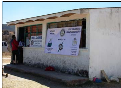
"Jose Indalecio Manzano Briseno" School