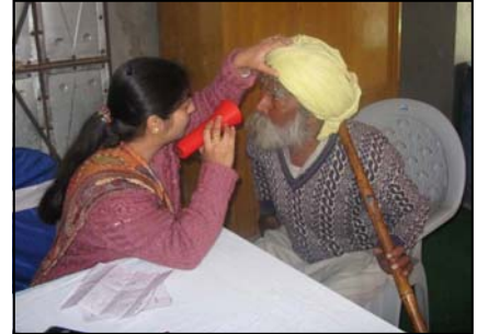
A village member having his eyes examined