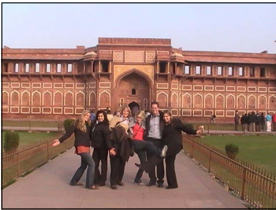
GSE Team in front of Fort Agra