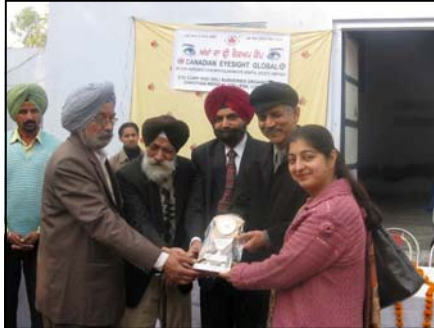
Dignitaries were presented mementoes as token of love