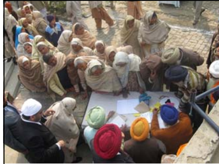
Villagers registering to have their eyes examined