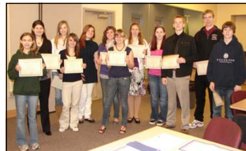
Student of the Quarter awardees during club breakfast on January 21, 2010

It has been an honor to be the editor of the Peace Arch Journal. I will conclude my term in this position with the June, 2011, edition.