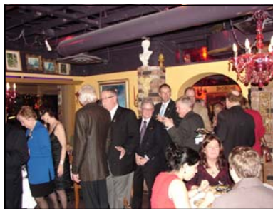
Guests lined up to enjoy the Delicious buffet

On February 6, 2010, the Rotary Club of Port Moody (morning) celebrated their 10th anniversary at the Saint Street Grill in Port Moody with club members, visiting Rotarians, family and friends.