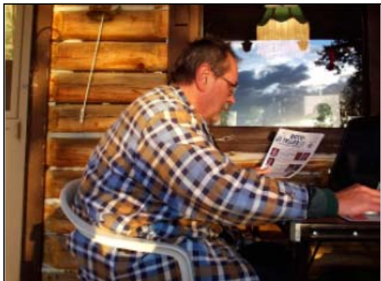
Working in his Roto-Teller office in the Cariboo.