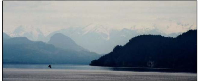
The dark spot above the water line is an eagle.

Harrison Hot Springs Resort Hotel , nestled on the tranquil shores of Harrison Lake, is the site of the District 5050 Conference for year 2011. In past years this ever popular destination resort has hosted at least two other very successful District Conferences.