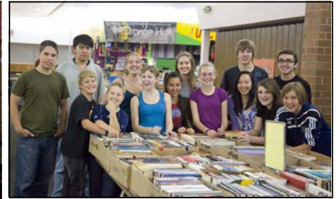
Searching for books and helping out at the Chilliwack Mall