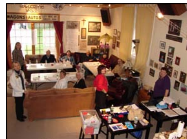
An historic building in which this room was once a blacksmith shop.