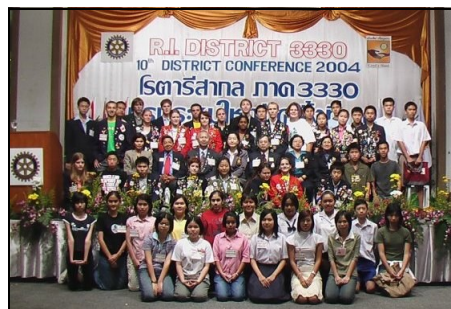
"I was 15 when I was on a Rotary Youth Exchange"

I embarked on my journey in July 2003 to exotic Thailand. I will never forget the memories of my life, my friends, my family and all of the amazing Rotarians I met during my time in Thailand. My year abroad also came with challenges that shaped and changed my life forever. Separatist Muslims began to bomb my hometown and death threats were made on every foreigner found within city limits. Life in small town Thailand became scary, and I will never forget the day that all of the RYE students and I fled the city, with my host mother sobbing uncontrollably at the bus station. This memory has stayed with me since that day.