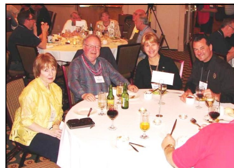
On Thursday we had Dinner & Entertainment