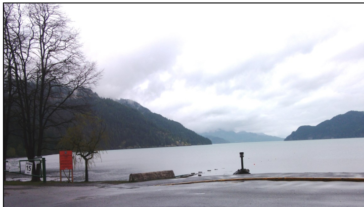
Outside, it was cloudy as we looked out from the hotel. Inside, the Rotarian fellowship was bright as we celebrated.