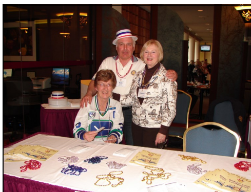
We were Welcomed at the Registration Table