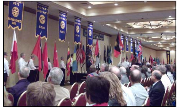
President Elect Training Seminar began on February 18, 2011, with the flag ceremony

This year's PETS was of special interest for your editor of the Peace Arch Journal because he is going to be the 2011-2012 president of the Rotary Club of Snohomish. Information about PETS and resource material may be downloaded at: http://www.pnwrotarypets.org/ .