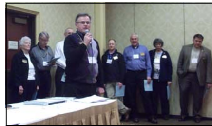
AGs put on a skit sharing some thing on each letter spelling out part of the RI theme for 2011-12, Reach Within to Embrace Humanity