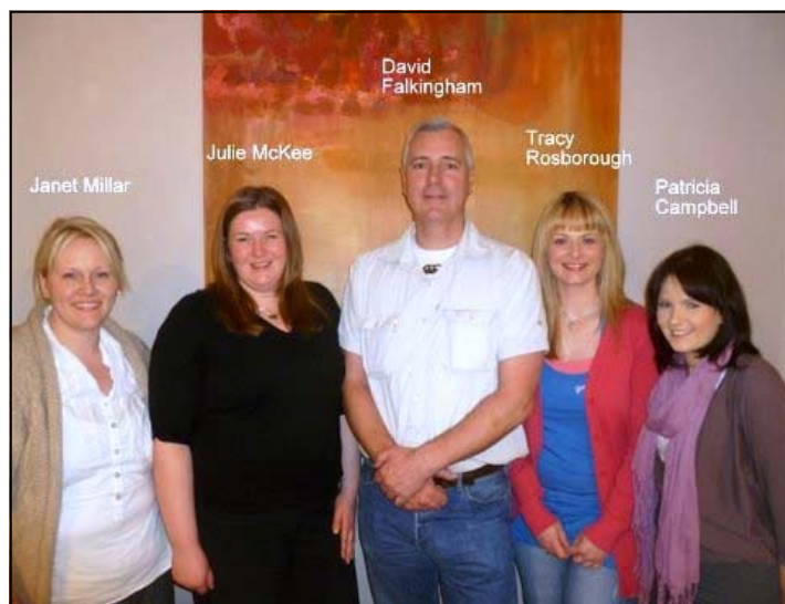
The Ireland GSE Team

Currently there are two teams visiting District 5050. One is from Ireland and the other is from North Korea.