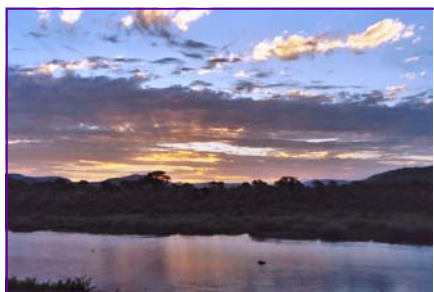
A South African Sunset 2005