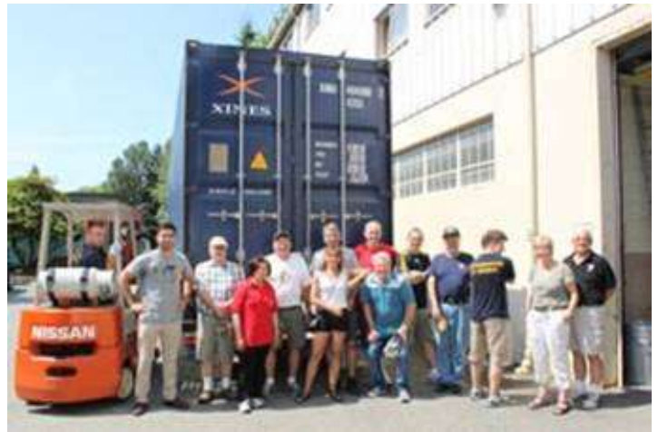
Thanks to all the Rotarians, Rotaractors, and friends of Rotary who came out to help, sort, move, load, stack, pack and document the 637 boxes and pieces of equipment bound for warmer climes! (Cebu, Philippines)