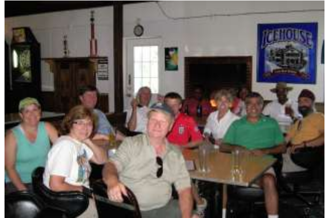
District Hikers reach their goal on Oyster Dome, then celebrate their accomplishment.