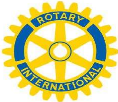
Rotary District 5050