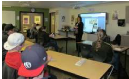
(B) AIM High School