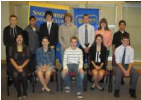
(A) Secondary Students