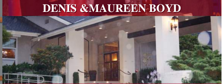
EVERETT COUNTY CLUB