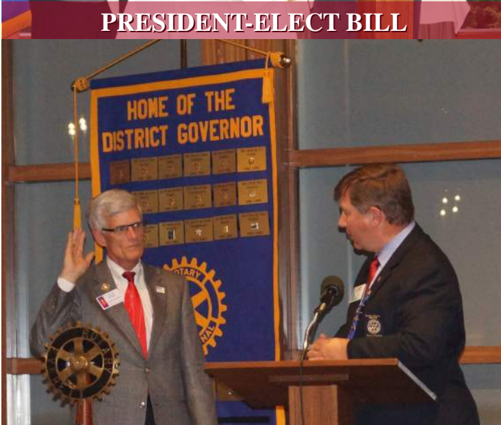
GOVERNOR'S OATH OF OFFICE